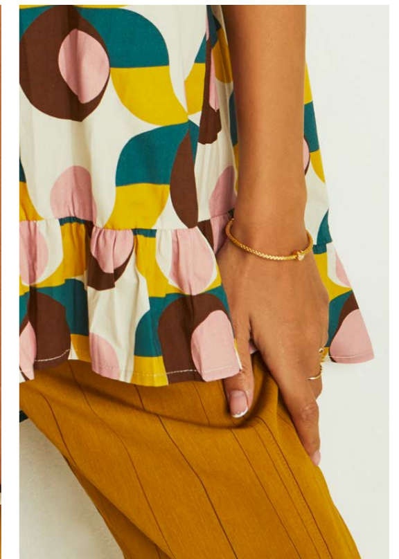
Top 8052 - Pantalone 8016