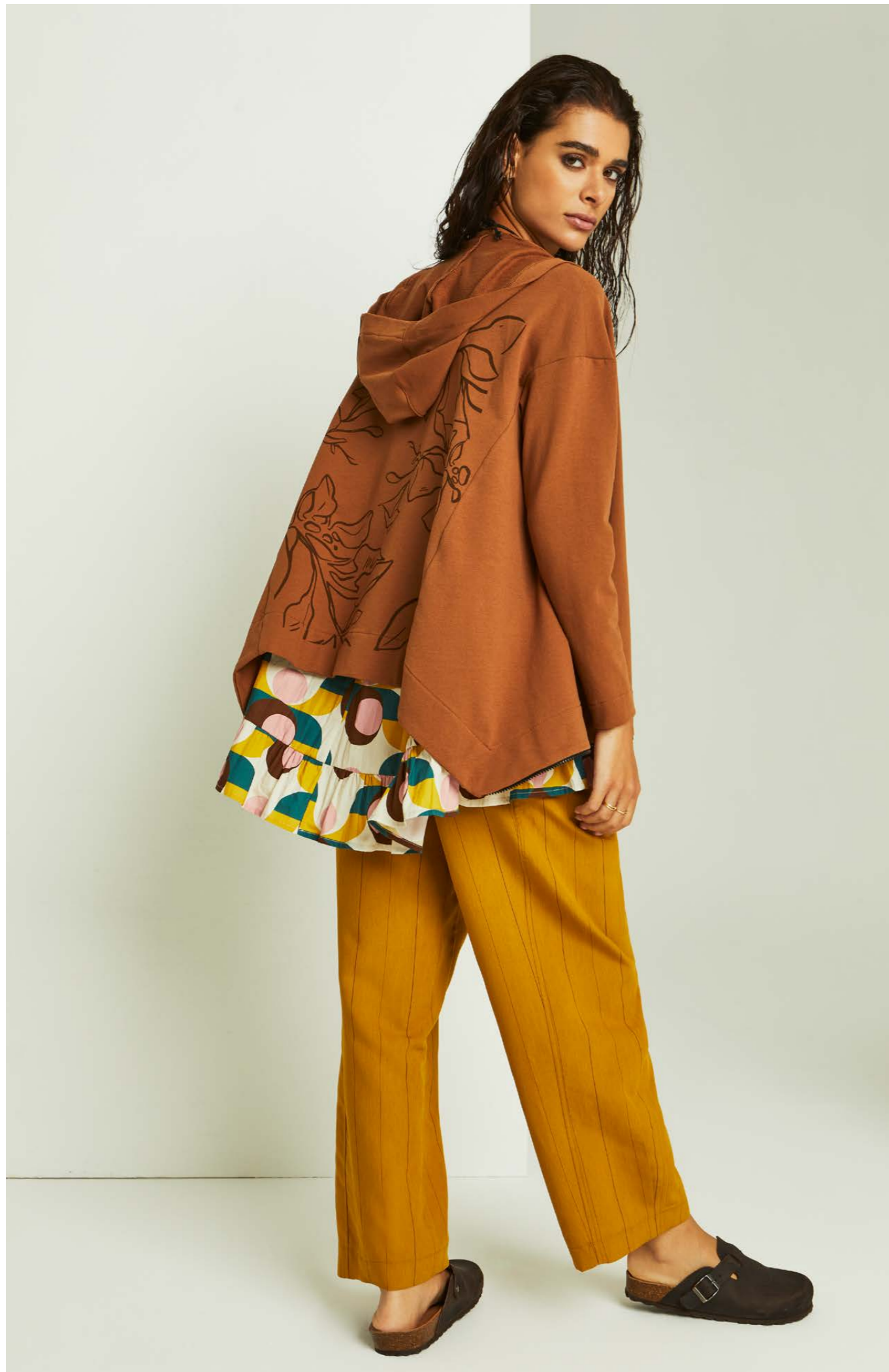
Cardigan felpa 8045 - Top 8052 - Pantalone 8016