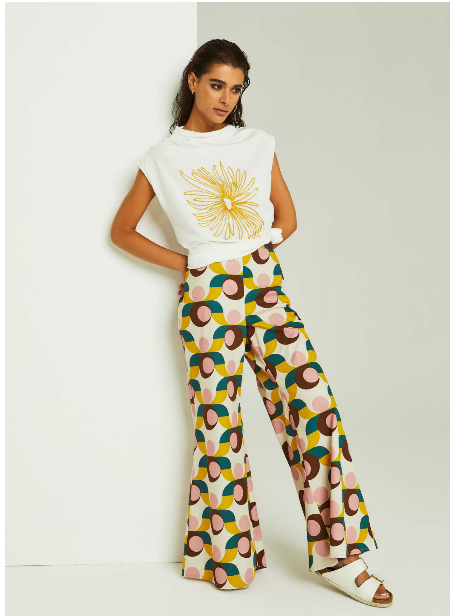
T-Shirt 8046 - Pantalone 8042