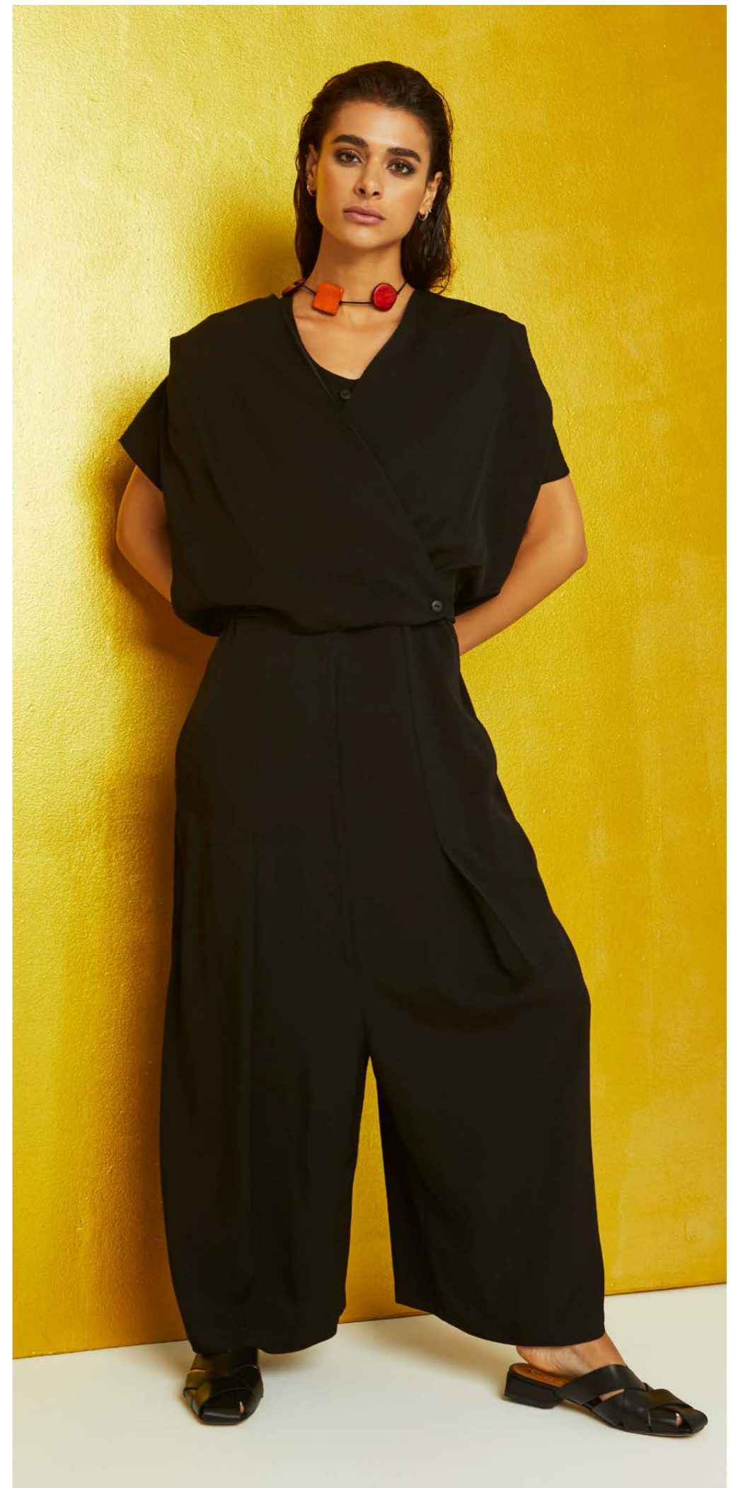
Gilet 8005 - Tuta 8001