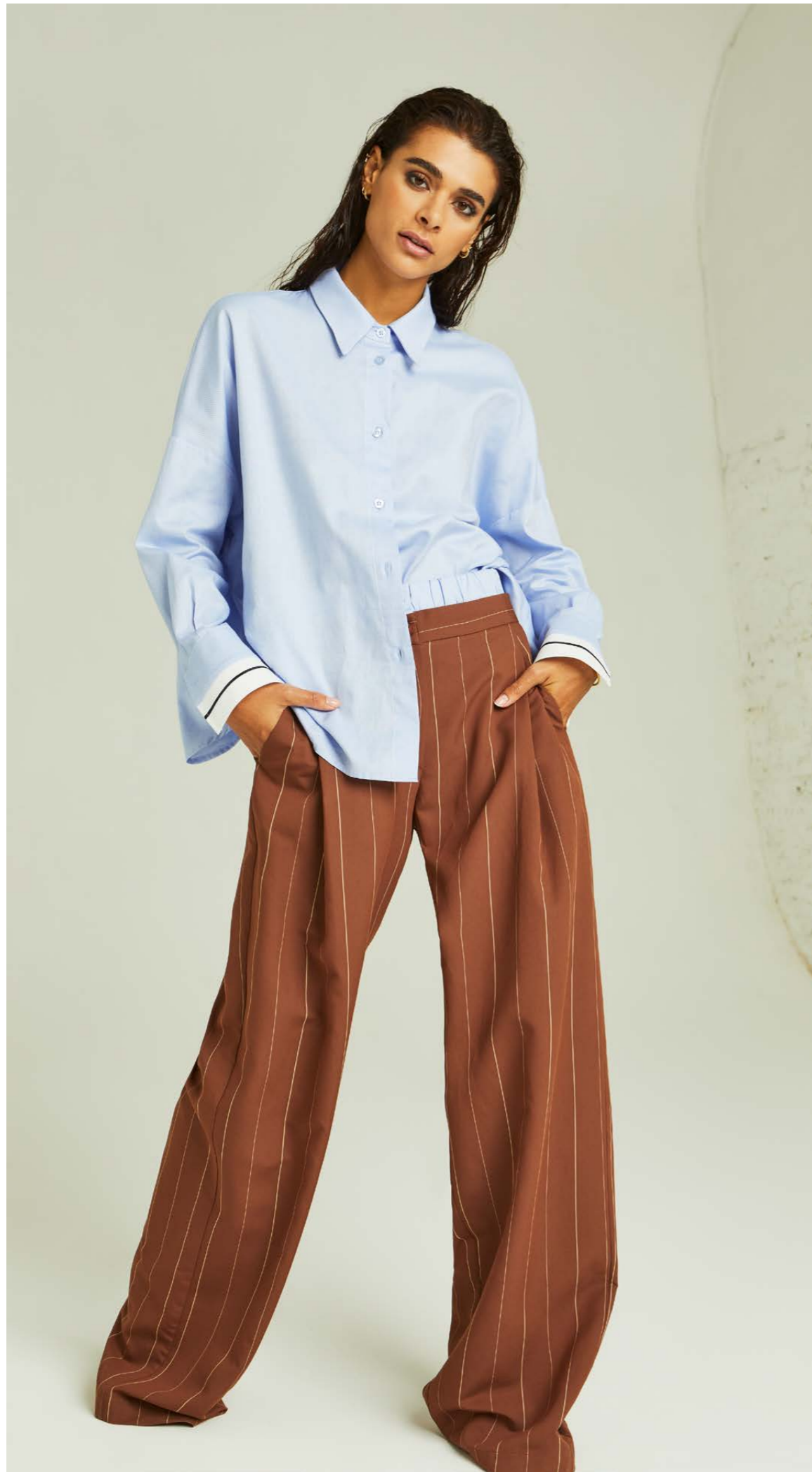
Camicia 8013 - Pantalone 8015