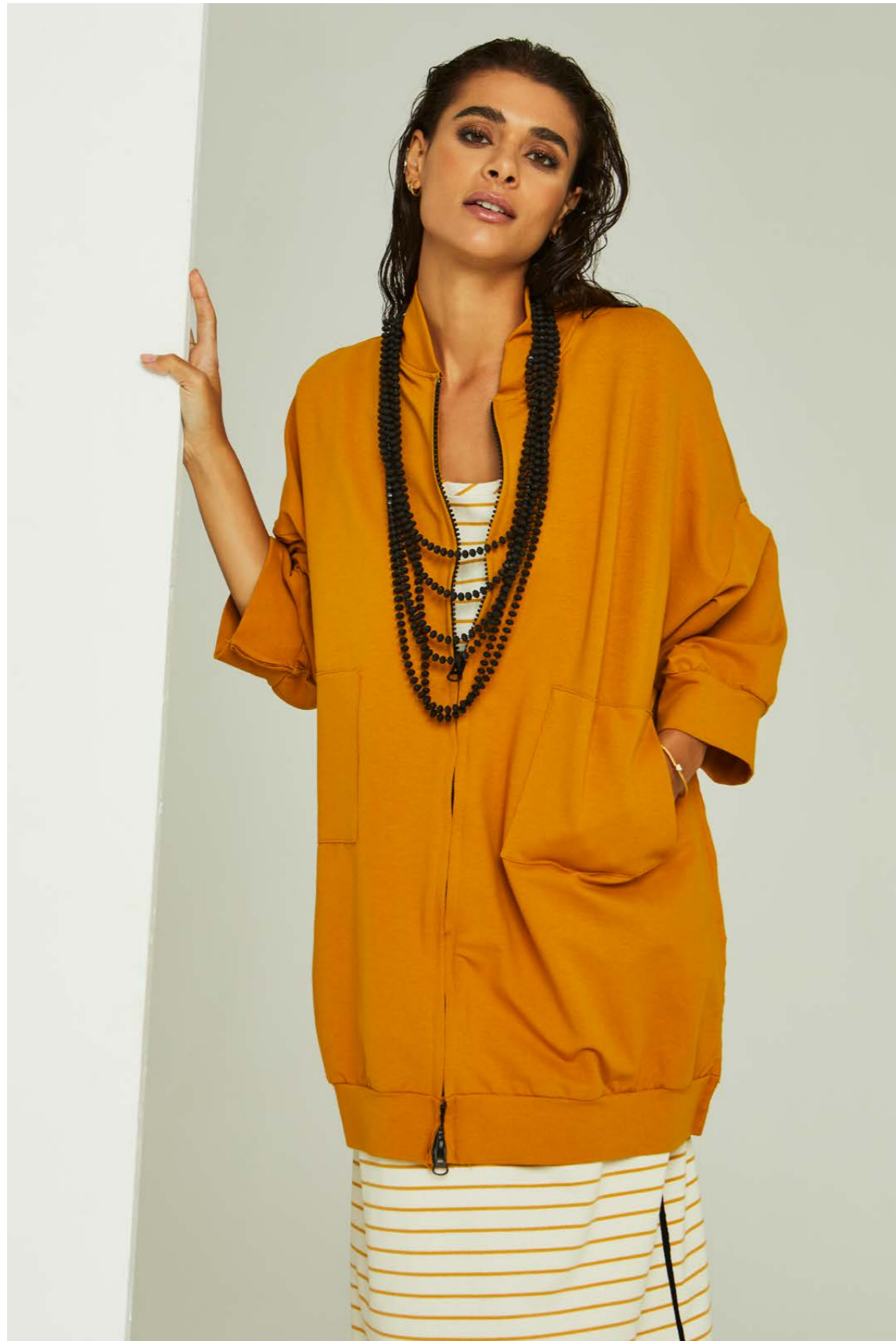
Cardigan felpa 8034 - Abito 8043