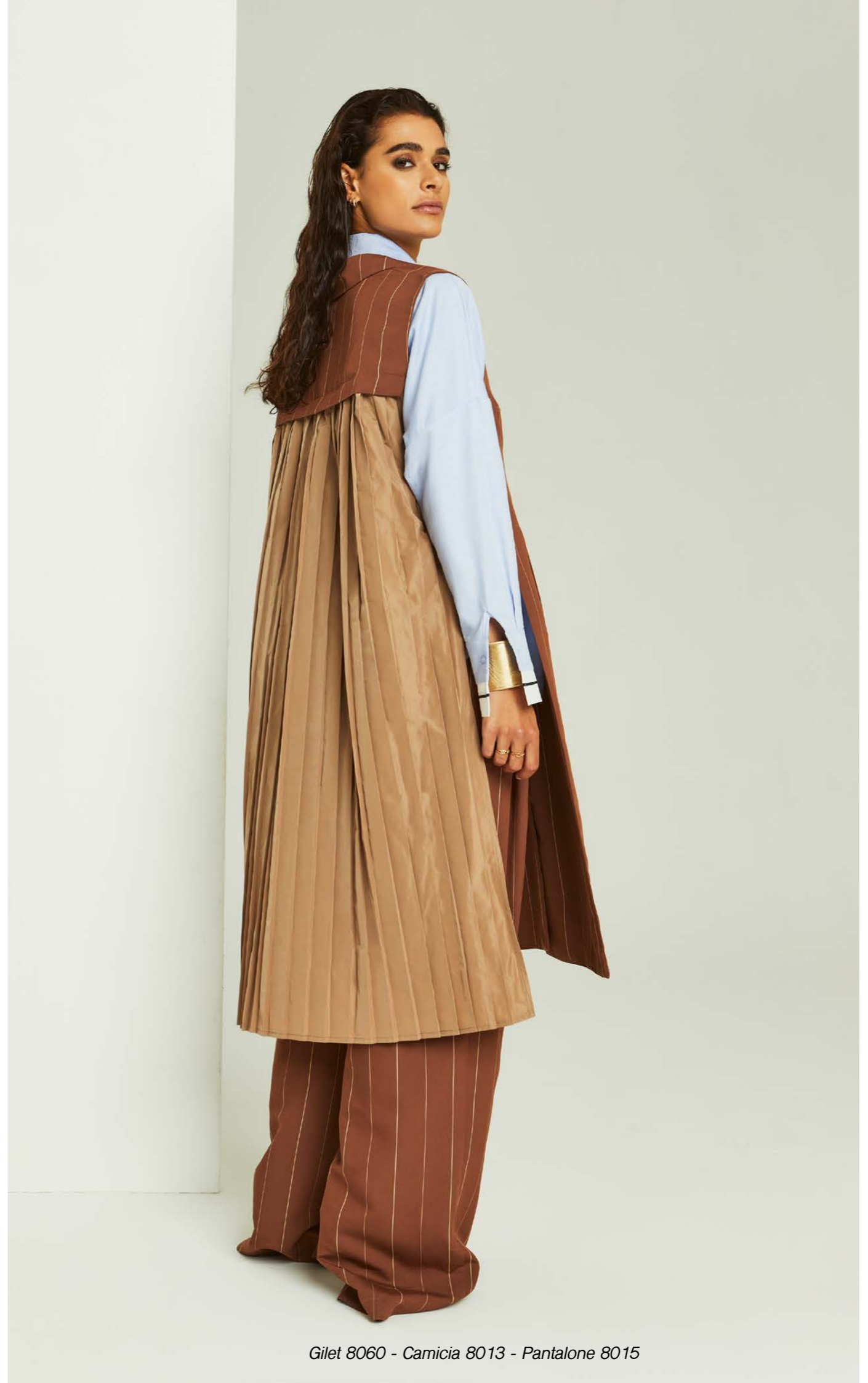
Gilet 8060 - Camicia 8013 - Pantalone 8015