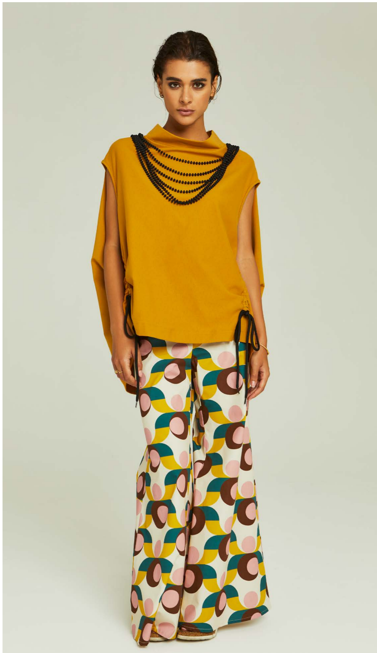
Felpa 8033 - Pantalone 8042